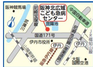
Kodomo kyukyu Center